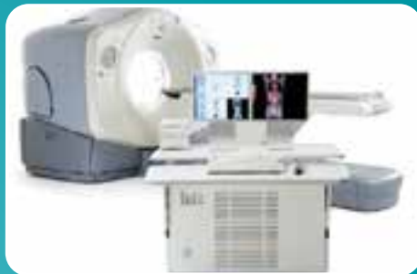
PET Scan (1st in Madhya Pradesh)