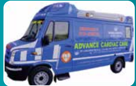
ICCU on Wheels