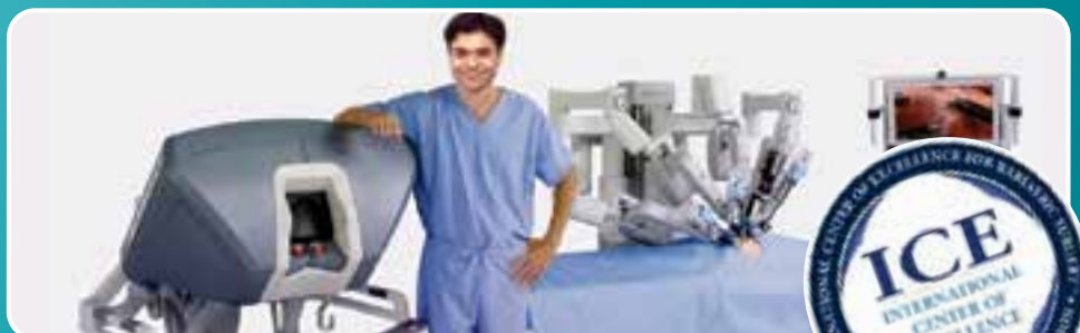
DA Vinci SI Robotics (1st in Madhya Pradesh)