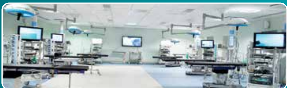
LASER (Learning Academy of Simulated Education & Research)