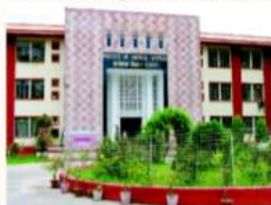
Institute of Medical Sciences