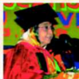
91 th Convocation – 2009 Hon'ble President of India Smt. Pratibha Devi Singh Patil