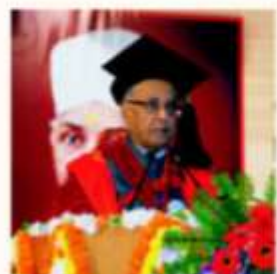
Special Convocation – 2013 Hon'ble President of India Shri Pranab Mukherjee