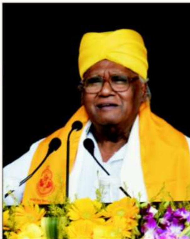
99 th Convocation – 2017 Bharat Ratna Prof. C.N.R. Rao, FRS