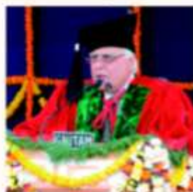
93 th Convocation – 2011 Hon'ble Minister of HRD Shri Kapil Sibal