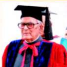
89 th Convocation – 2007 Hon'ble Vice-President of India Shri Bhairon Singh Shekhawat