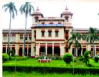
Institute of Agricultural Sciences