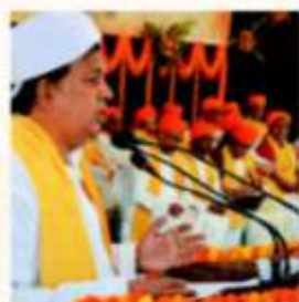
97 th Convocation – 2015 Padma Vibhushan Dr. G. Madhavan Nair