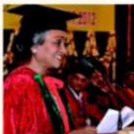
94 th Convocation – 2012 Hon'ble Speaker of Lok Sabha Smt. Meira Kumar