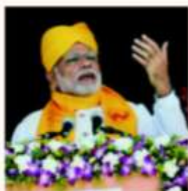
98 th Convocation – 2016 Hon'ble Prime Minister of India Shri Narendra Modi