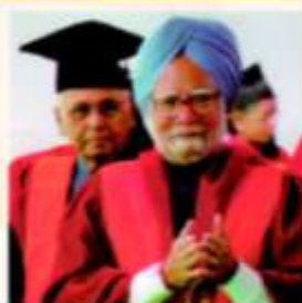
90 th Convocation – 2008 Hon'ble Prime Minister of India Dr. Manmohan Singh