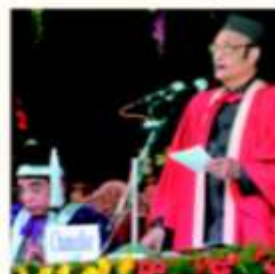
95 th Convocation – 2013 Hon'ble Chancellor of BHU Dr. Karan Singh