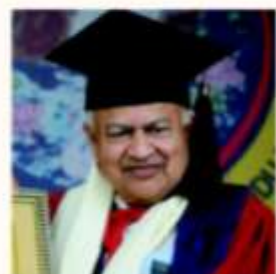
96 th Convocation – 2014 Padma Vibhushan Prof. Jayant Vishnu Narlikar