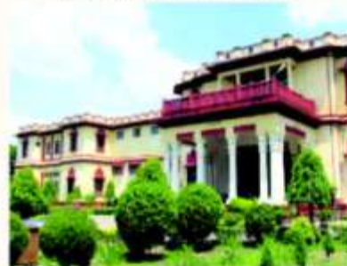
Bharat Kala Bhawan