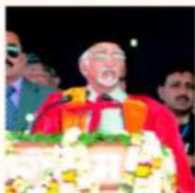
92 th Convocation – 2010 Hon'ble Vice-President of India Shri Hamid Ansari