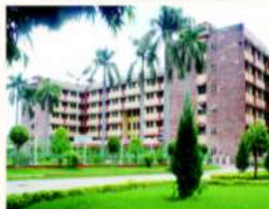
Sir Sunderlal Hospital