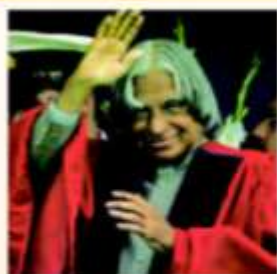
88 th Convocation – 2006 Hon'ble President of India Dr. APJ Abdul Kalam