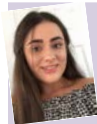
Shannon O'Donnell Geography Open Scholarship

The closing date for applications for candidates who live outside of the UK is 15 th January 2020. You will need to complete a paper application form and email or post it to us (we cannot accept online applications from candidates who live outside of the UK). Please note that late applications will NOT be accepted.