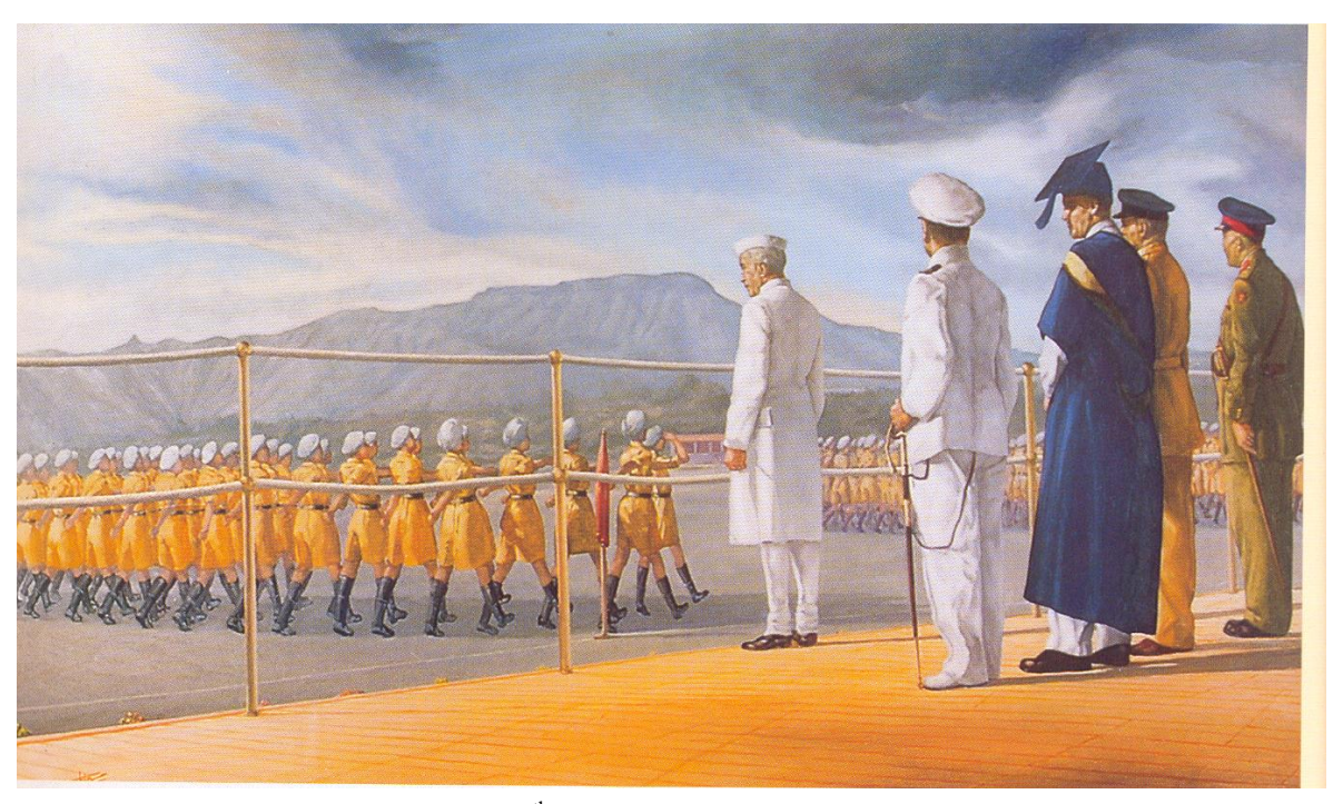
First POP at NDA, Khadakwasla... 10<sup>th</sup> Course POP reviewed by Pt Nehru, Hon PM of Inida 05 Jun 1955.

5. The NDA, in its various avatars, has completed sixty years of eventful service in January 2009. This institution is proud that over 31,000 of its alumni have joined the Armed Forces of India as well as of many foreign countries after having imbibed academic and military training of the highest standard in an unique inter-services ambience. The NDA is also proud that amongst its alumni are many winners of the nation's highest awards for Gallantry and Distinguished Service, both in peace and in war. We cherish with pride, the honour-roll of so many other former NDA cadets who have laid down their lives in battle, to uphold the safety and integrity of our Republic. The NDA has the distinction of many of its alumnus, reaching the pinnacle of military achievement by becoming Chiefs of their respective Services.