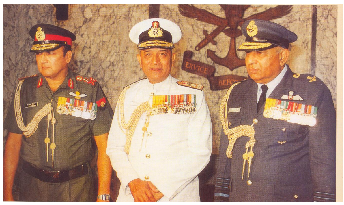
A historic Day... Service Chiefs of the 1<sup>st</sup> Course at the NDA 30 Nov 1991

5. The NDA, in its various avatars, has completed sixty years of eventful service in January 2009. This institution is proud that over 31,000 of its alumni have joined the Armed Forces of India as well as of many foreign countries after having imbibed academic and military training of the highest standard in an unique inter-services ambience. The NDA is also proud that amongst its alumni are many winners of the nation's highest awards for Gallantry and Distinguished Service, both in peace and in war. We cherish with pride, the honour-roll of so many other former NDA cadets who have laid down their lives in battle, to uphold the safety and integrity of our Republic. The NDA has the distinction of many of its alumnus, reaching the pinnacle of military achievement by becoming Chiefs of their respective Services.