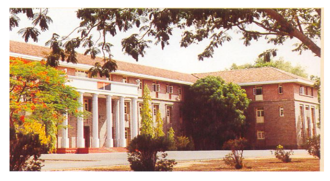
Squadron Building: Living Accomodation for Cadets