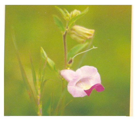
Wild Sesame (Sesamum Indicum)