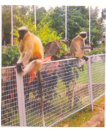
Common Langur (Presbytis Entellus)