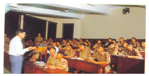
A class in progress