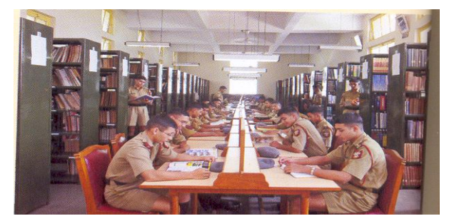
Vyas Library: Reference Section

12. The Academy has a full-fledged Department of Computer Science. Limited vacancies are available for the cadets to undergo B.Sc. linked with Computer Science. These vacancies are allotted on the basis of a screening test held at the end of the first week of the commencement of the term.