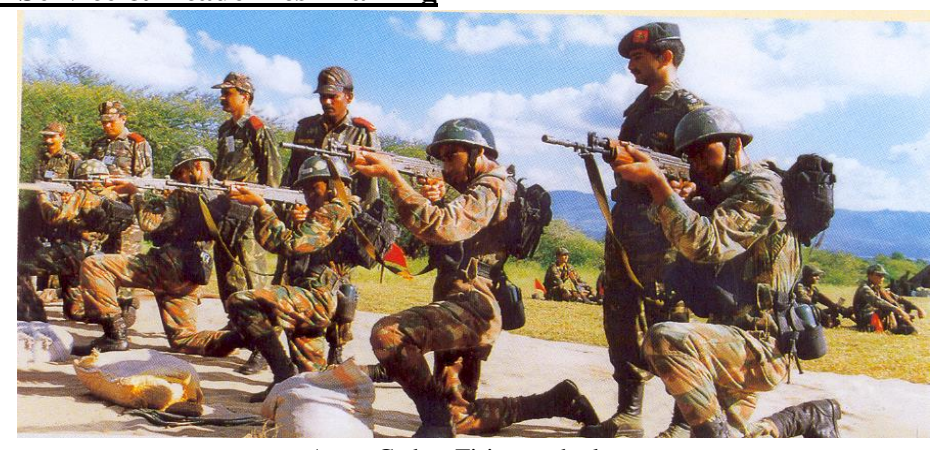
Army Cadets Firing at the long range