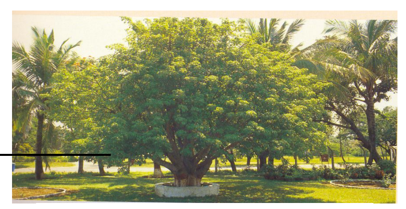
Baobab (Adansonia Digitata) and Coconut Palm (Cocos Nucifera)

14. Spread over 6735 acres, the NDA has a salubrious climate with a mean temperature of 24.3 degrees C, pollution free environment, elaborate infrastructure and a wide variety of flora & fauna. March to May get warm but the monsoon is active in the area. Winters are mild. Blankets/quilts are necessary during Dec to Feb. Mosquito menace is experienced throughout the year.