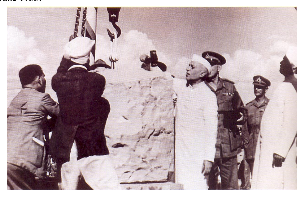
"A Monument in the Making" - Pt Nehru, the Hon PM of India, laying the foundation stone at Khadakwasla 06 Oct 1949