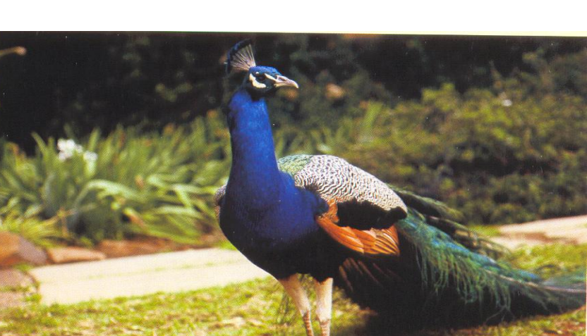
Peacock (Pavo Cristatus)