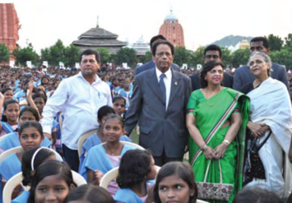
Sir Anerood Jugnauth, His Excellency the President of Mauritius and Lady Sarojni Jugnauth, Hon'ble First Lady of Mauritius with 12,000 students of KISS on the occasion of Children's Day celebration.