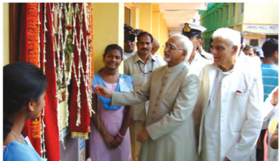
Shri M. Hamid Ansari, His Excellency The Vice President of India unveiling a golden plaque in his honour at Kalinga Institute of Social Sciences (KISS). Shri M. C. Bhandare His Excellency the Governor of Orissa looks on.